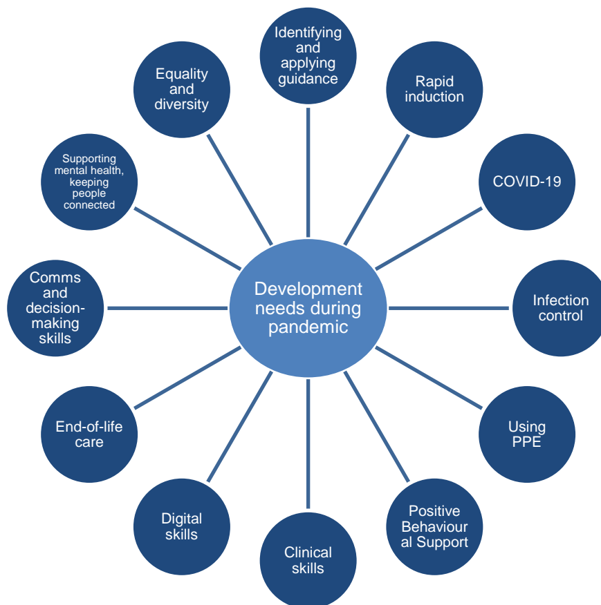
Figure 3.1: Development needs identified for the social care workforce as a result of the COVID-19 pandemic